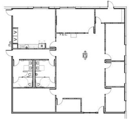
SHIPPING OFFICE - 935 SF