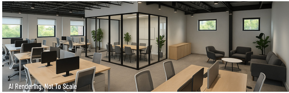
AI Rendering, Not To Scale