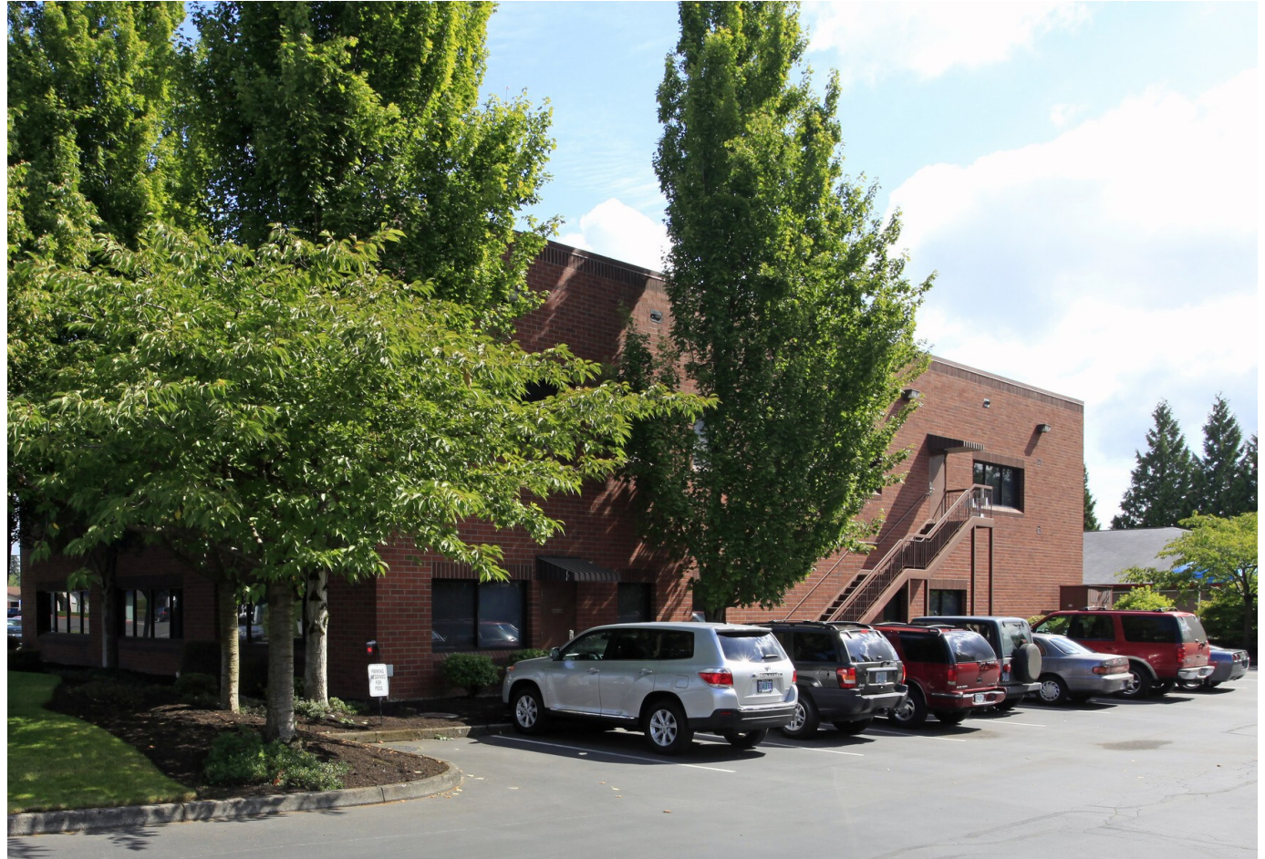
Back of building - Employee parking