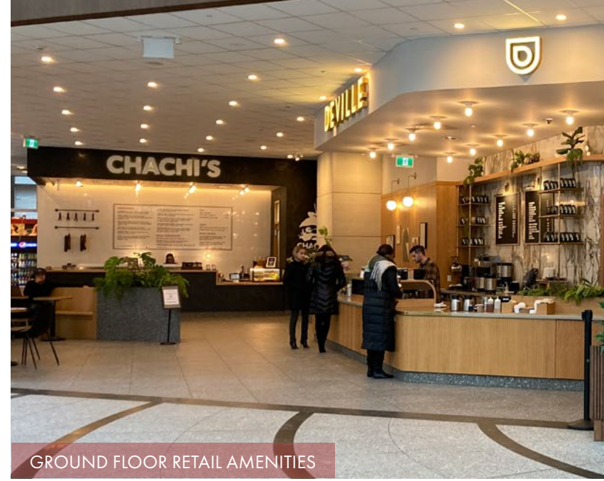
GROUND FLOOR RETAIL AMENITIES