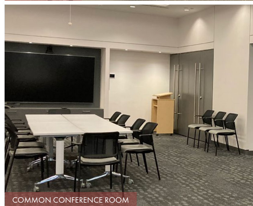
COMMON CONFERENCE ROOM