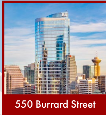
550 Burrard Street