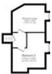
Ground Floor Floor area 52.0 sq.m. (567 sq.ft.)