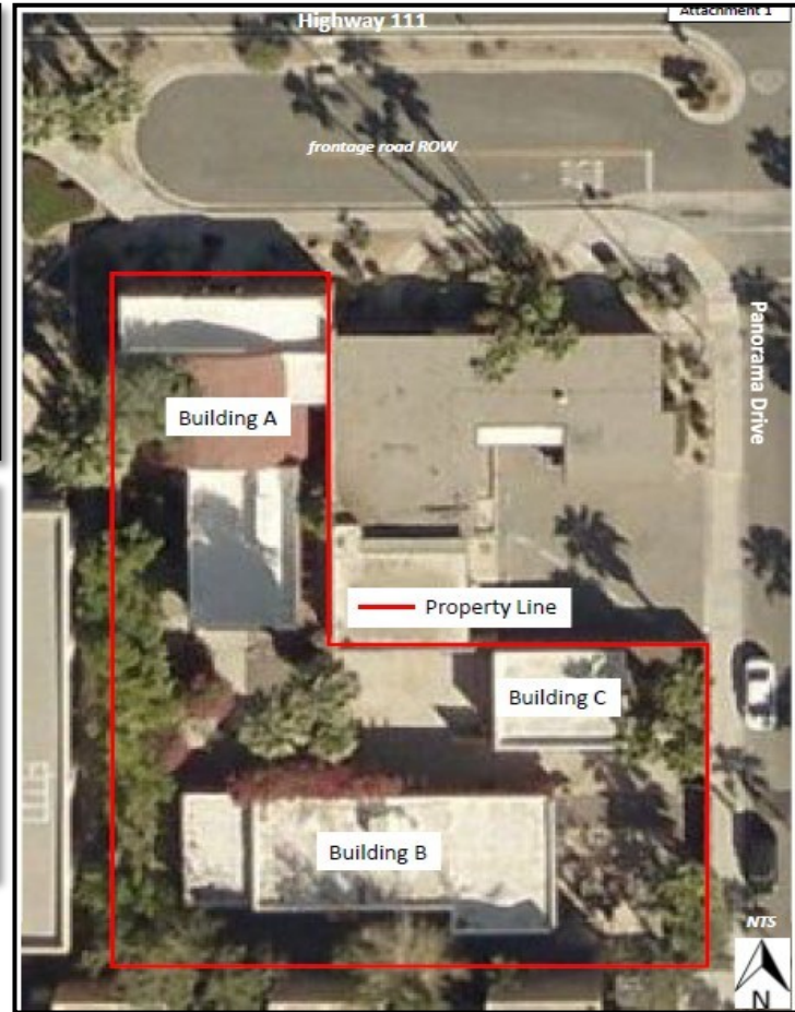
The property is located on one parcel with two addresses: 74271 Highway 111 – Building A: Retail Building 45125 Panorama Drive – Building B&C: Studios