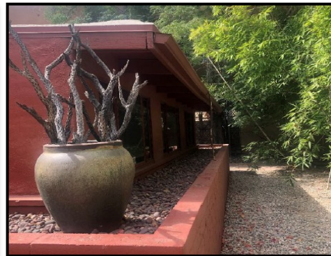
Building with Hwy 111 frontage and private studios in the rear portion of the property.