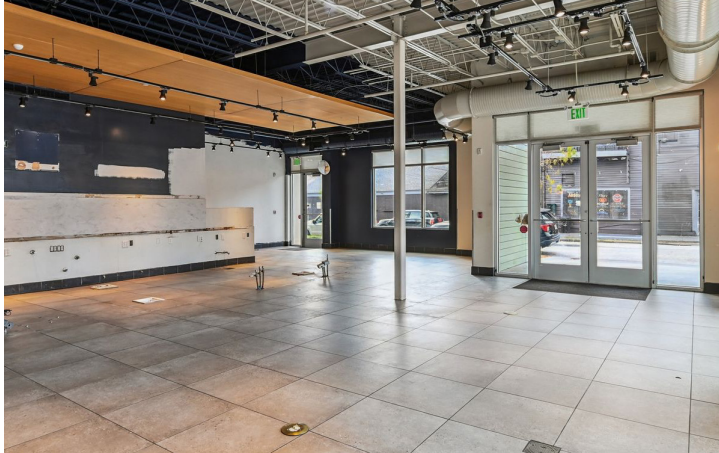
1001 Elysian Fields Ave