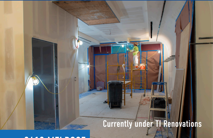
Currently under TI Renovations