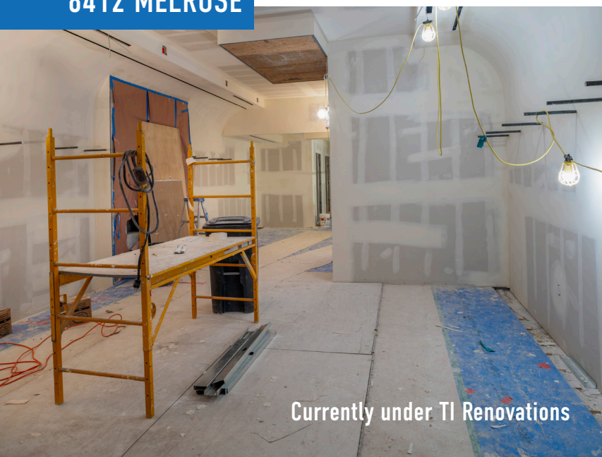
Currently under TI Renovations