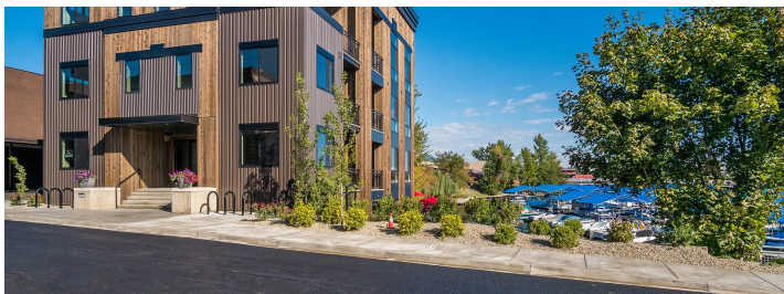
Street-level entry & landscaping

A rare opportunity to office directly on the water in downtown Sandpoint. This brand-new executive suite sits on the seawall — your private deck looks straight down on moored boats, across Sand Creek to the historic Power House, and out to the lake beyond. Walk in from the boat. Walk out to the courthouse.