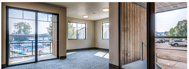
Interior — dual entry, marina views