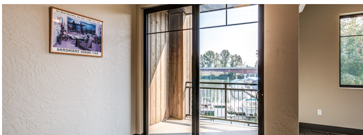
Private deck overlooking the slips