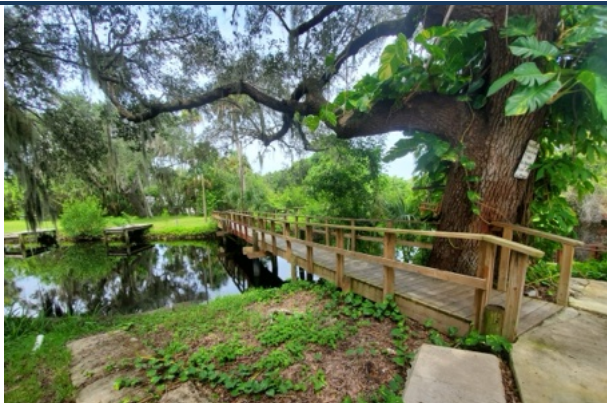
Island Bridge to Fish & Camp Retreat