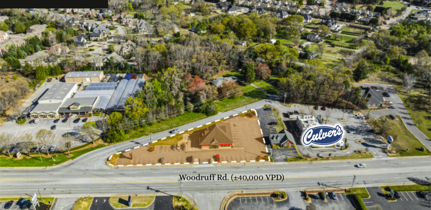
Woodruff Rd. (±40,000 VPD)