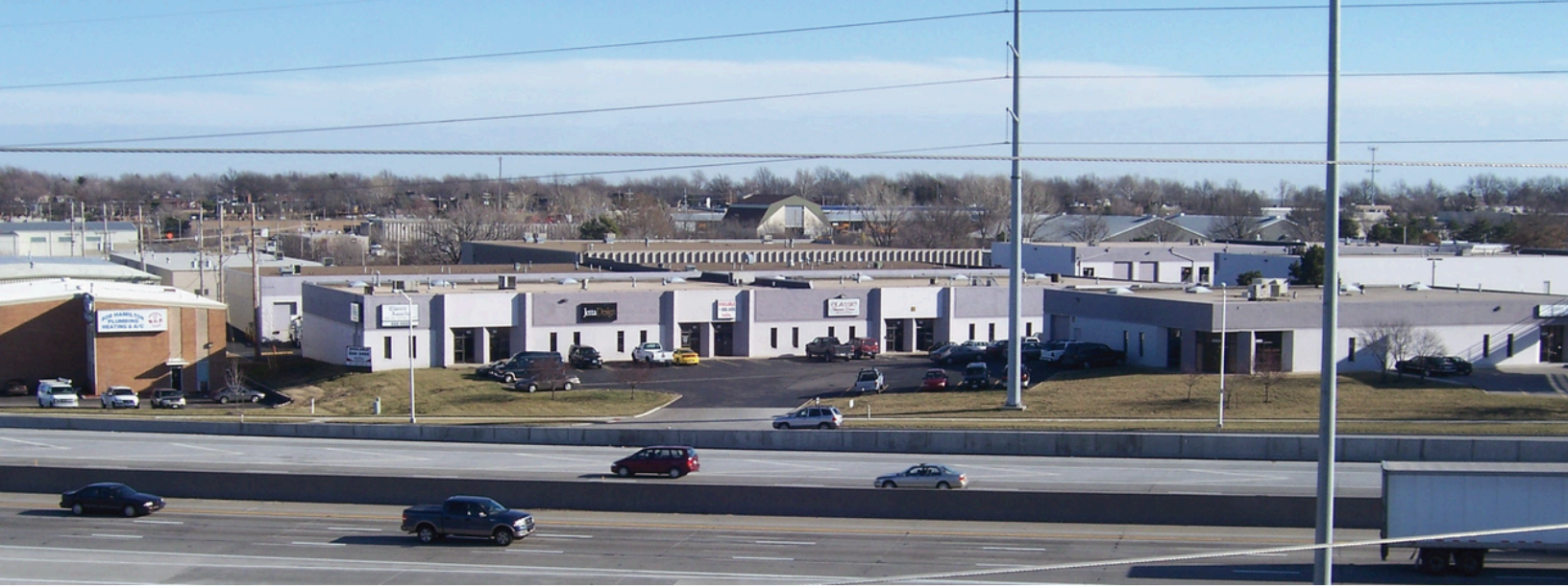
Easy Access to I-35, 69 Hwy