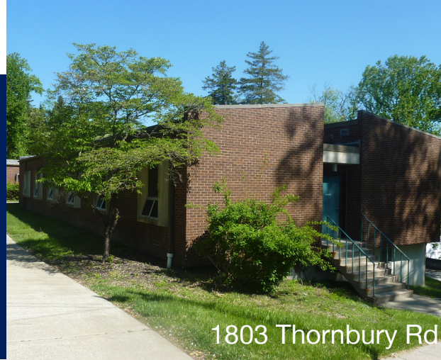
1803 Thornbury Rd