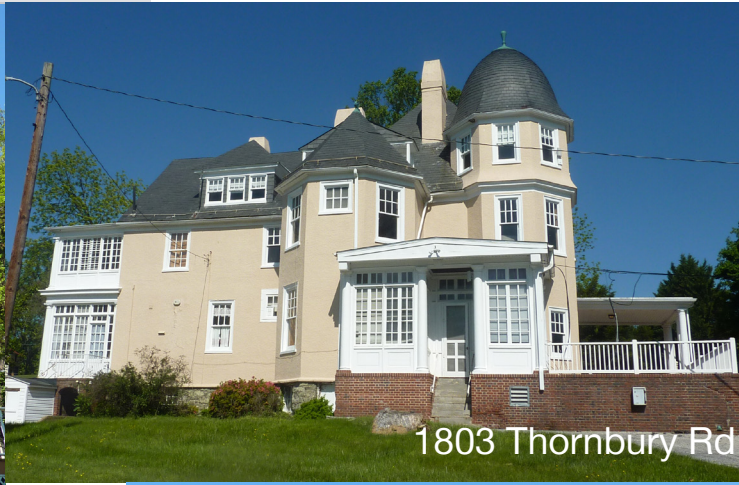
1803 Thornbury Rd