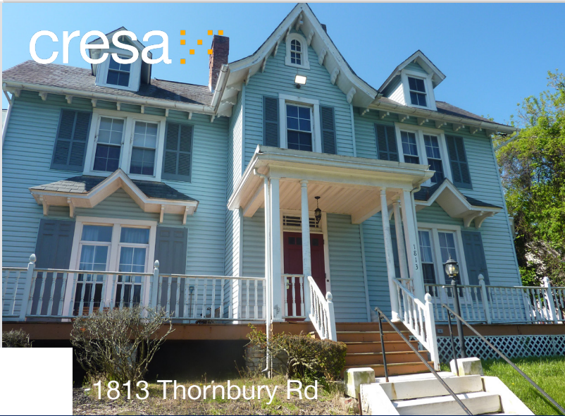
1813 Thornbury Rd