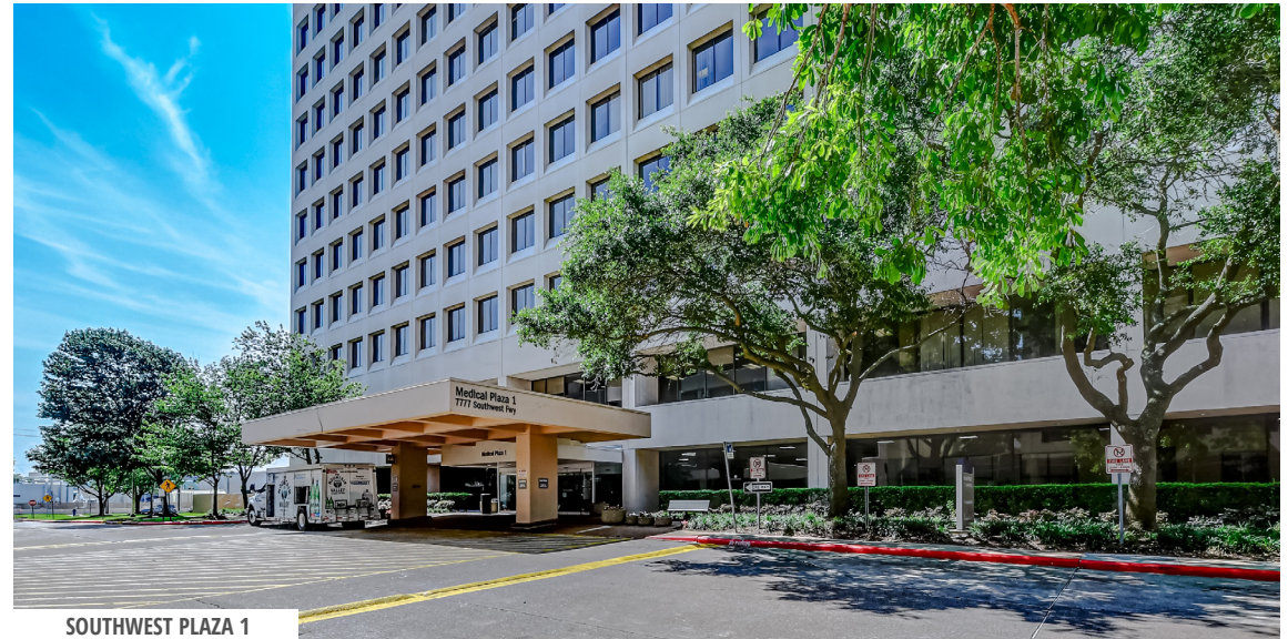
SOUTHWEST PLAZA 1

Patient Parking Validation Available Ample Parking - Covered and Uncovered