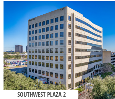
SOUTHWEST PLAZA 2