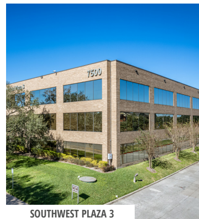
SOUTHWEST PLAZA 3