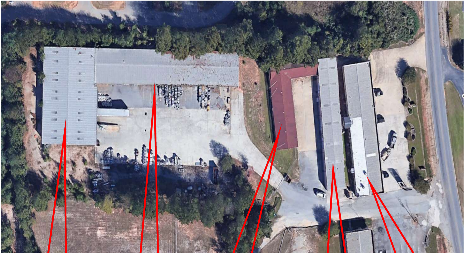
Bld. 460 A