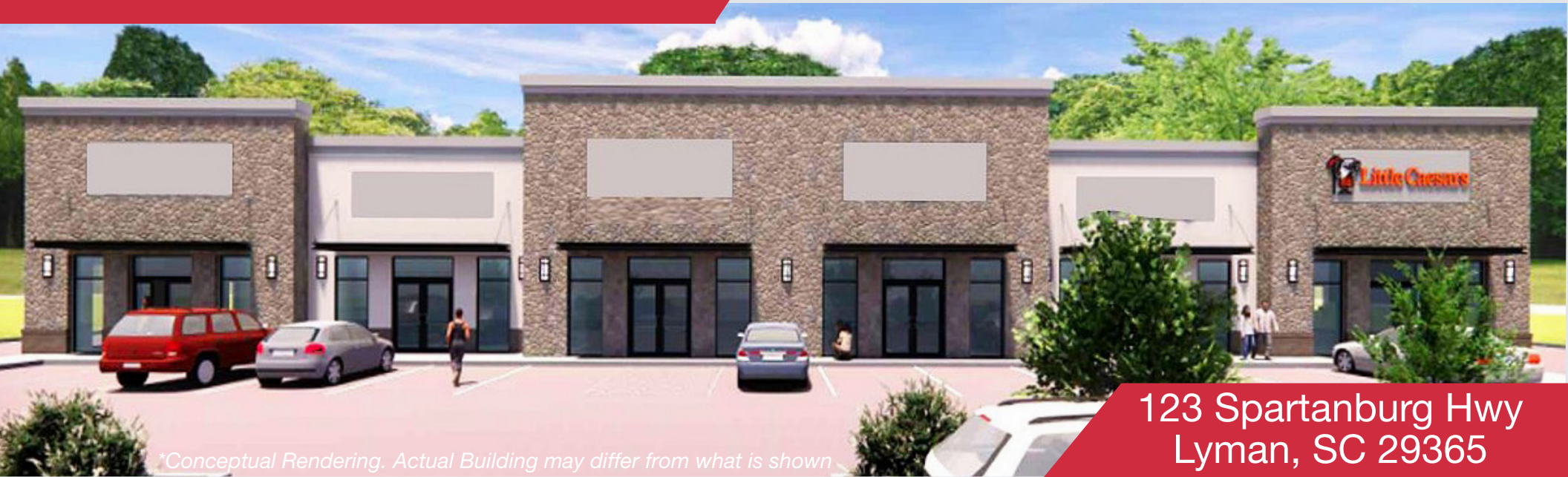
*Conceptual Rendering. Actual Building may differ from what is shown