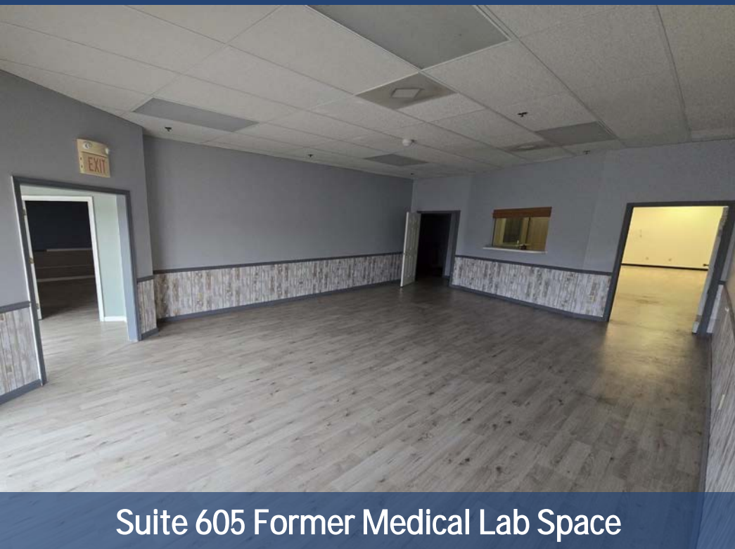
Suite 605 Former Medical Lab Space