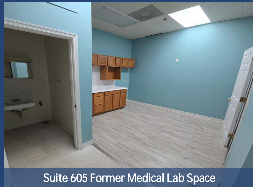
Suite 605 Former Medical Lab Space