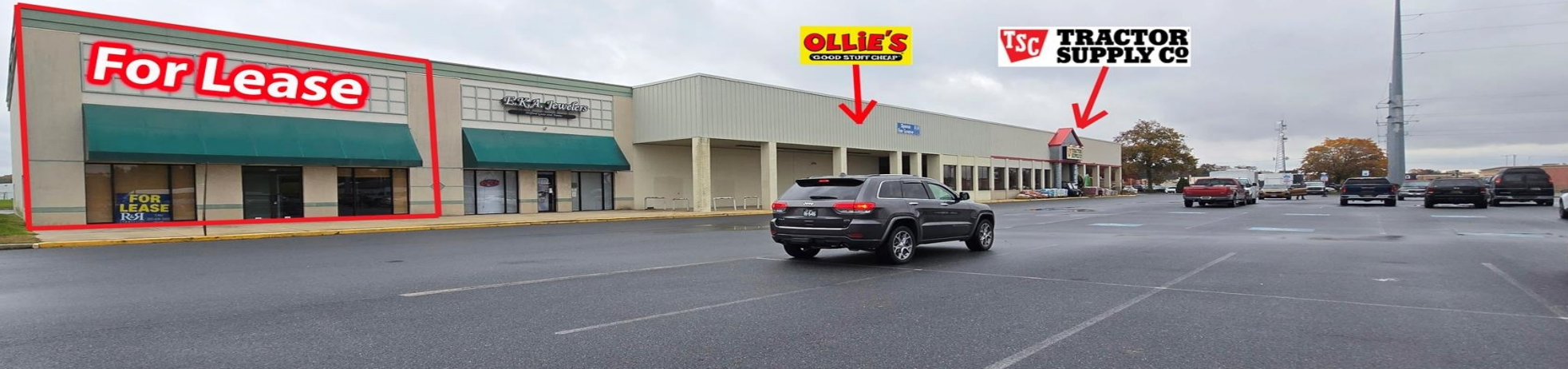
Suite 605 Next to Ollie's & Tractor Supply