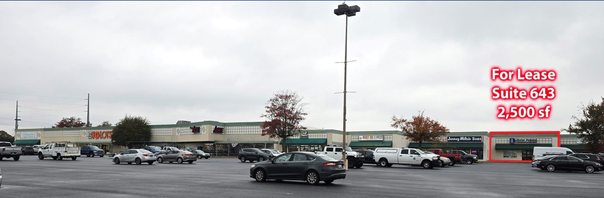
Suite 643 Next to Jersey Mike's