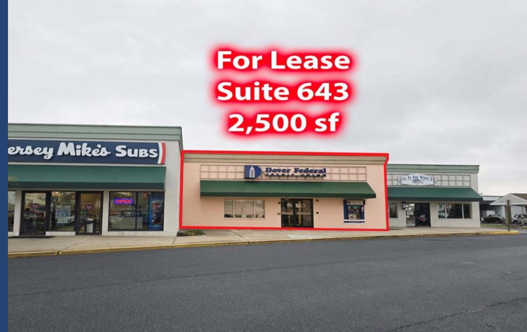
Suite 643 - 2,500sf - $18 NNN