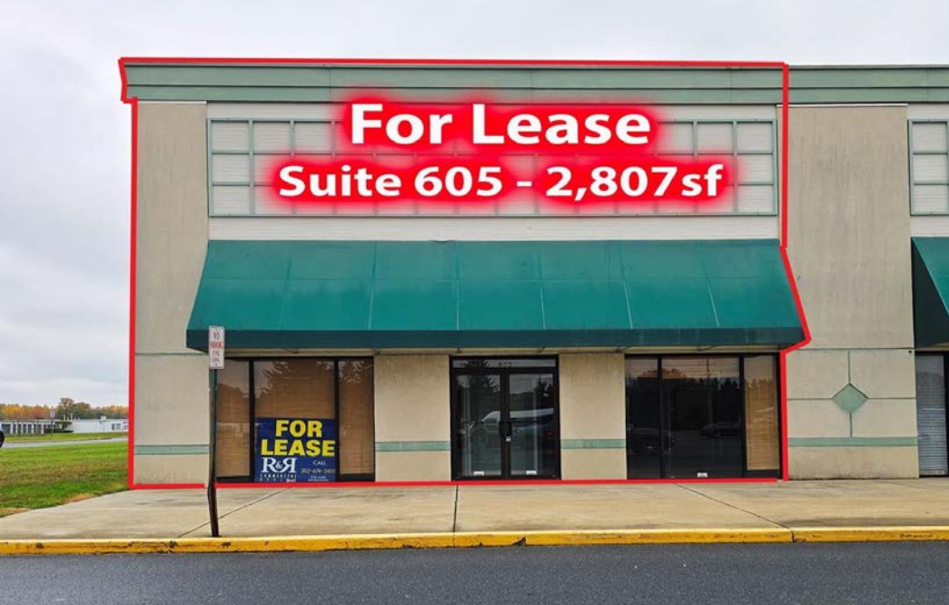
Suite 605 - 2,807sf - $16 NNN