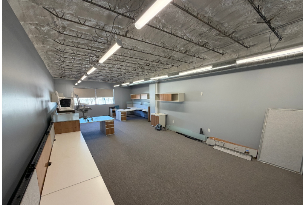
680 SF Available