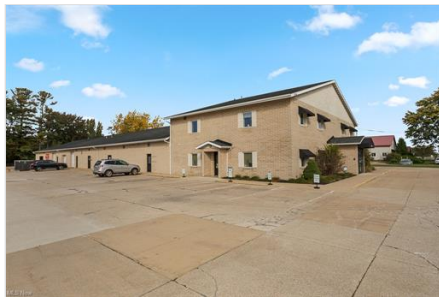
Front of Structure