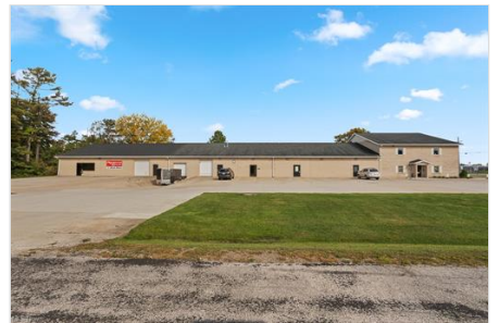
Front of Structure