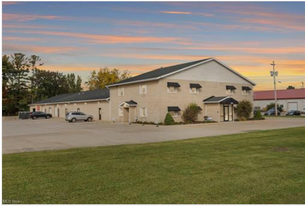
Front of Structure