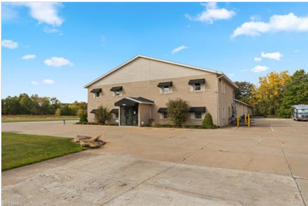
Front of Structure