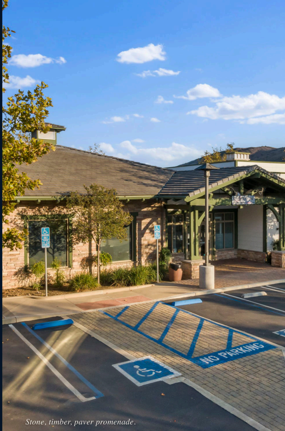
Stone, timber, paver promenade.