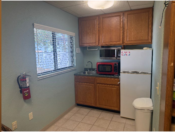
Kitchen Area in Conference