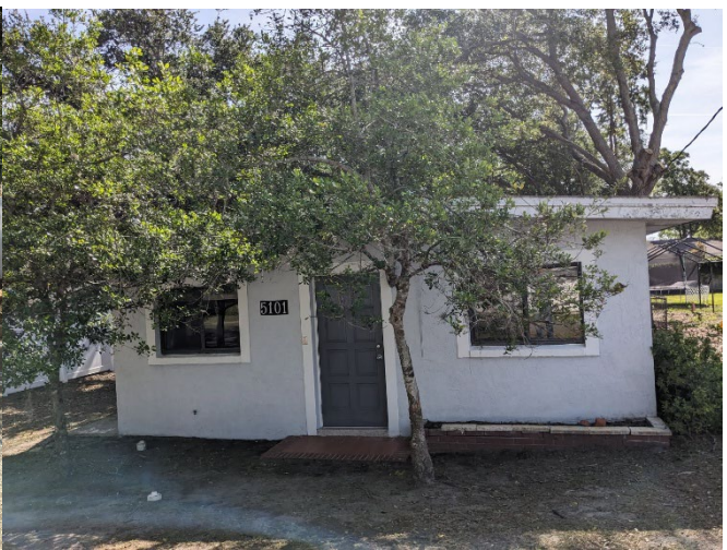
Andrus Avenue Frontage