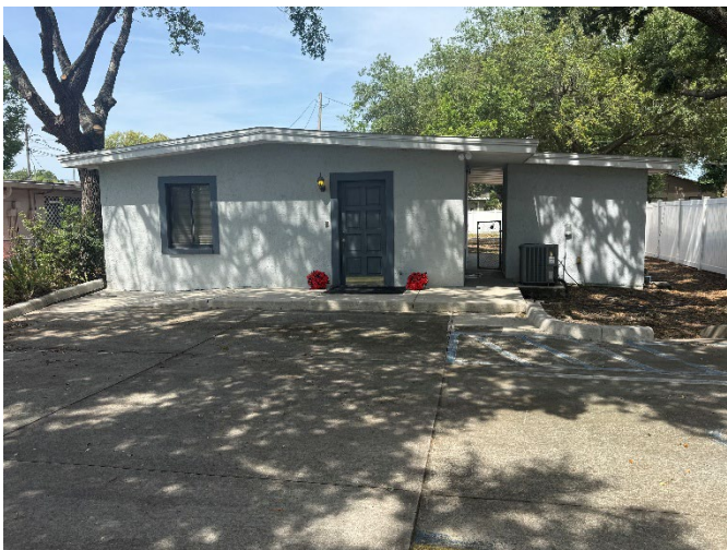
Goddard Avenue Frontage