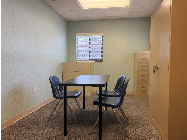
Rear Conference Room