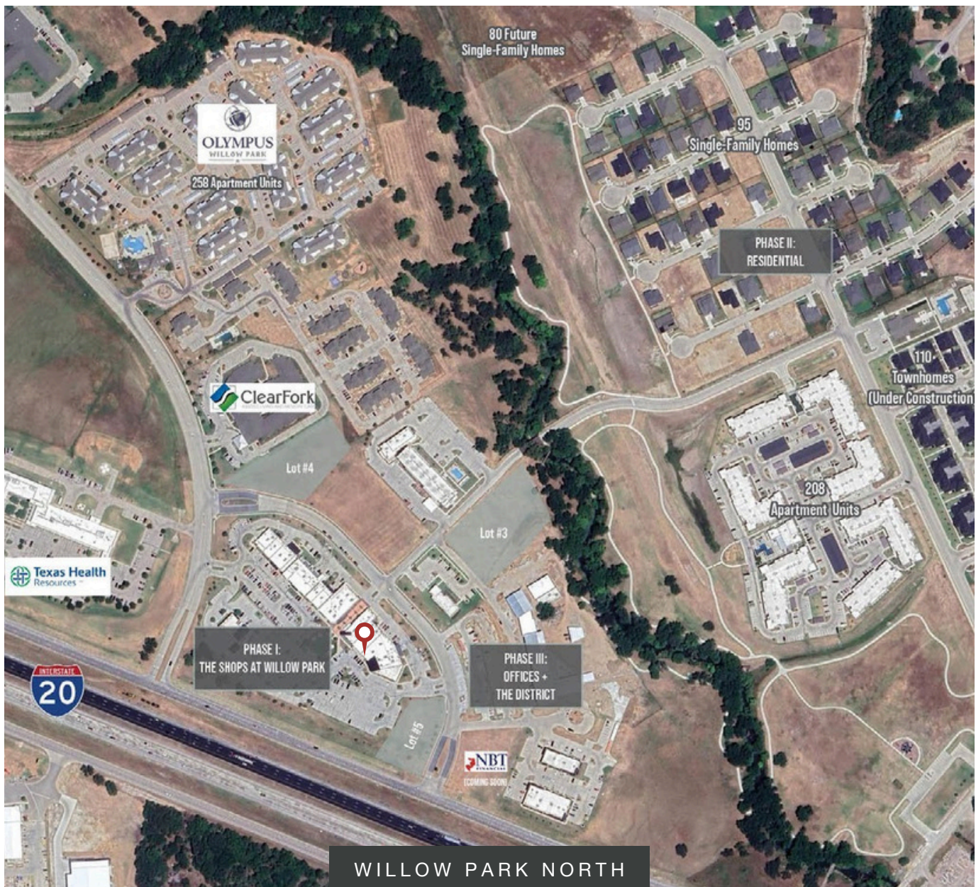
WILLOW PARK NORTH