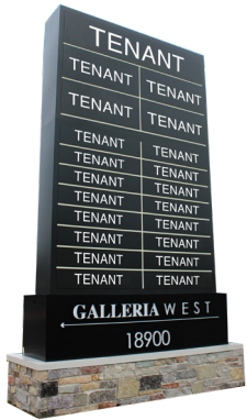
BRAND NEW 20' MONUMENT