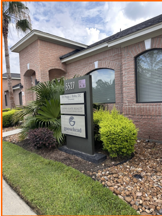
Onsite Project Management