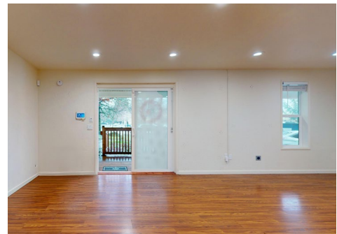
INTERIOR - EXIT TO PARKING

THIS FLOORPLAN IS NOT TO SCALE. SIZES AND DIMENSIONS ARE APPROXIMATE, ACTUAL MAY VARY.