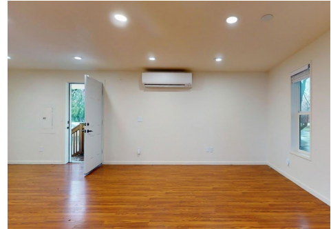
INTERIOR - EXIT TO LITTLEROCK