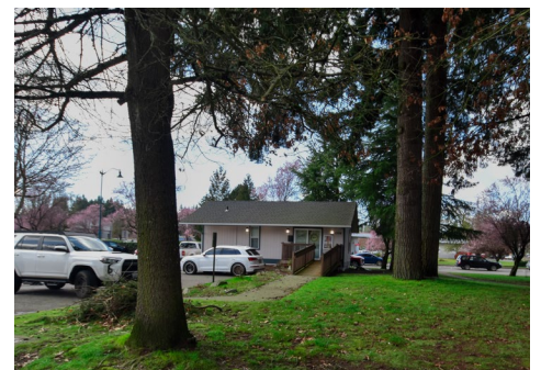
PARKING LOT ENTRANCE