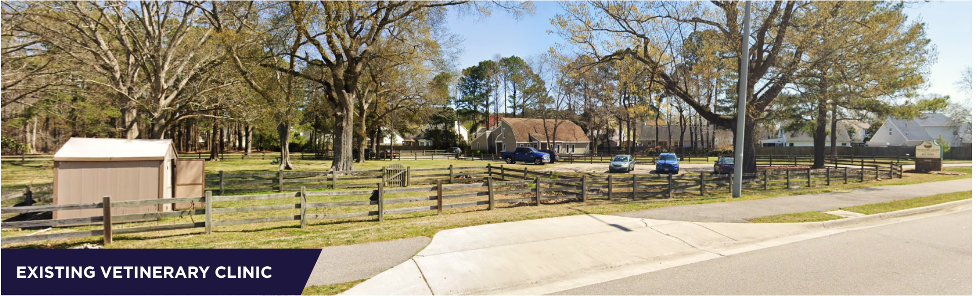
EXISTING VETINERARY CLINIC