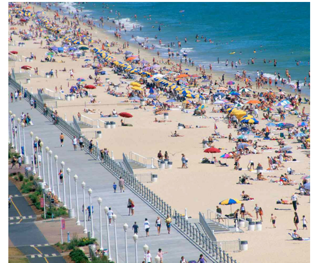
Virginia Beach Oceanfront