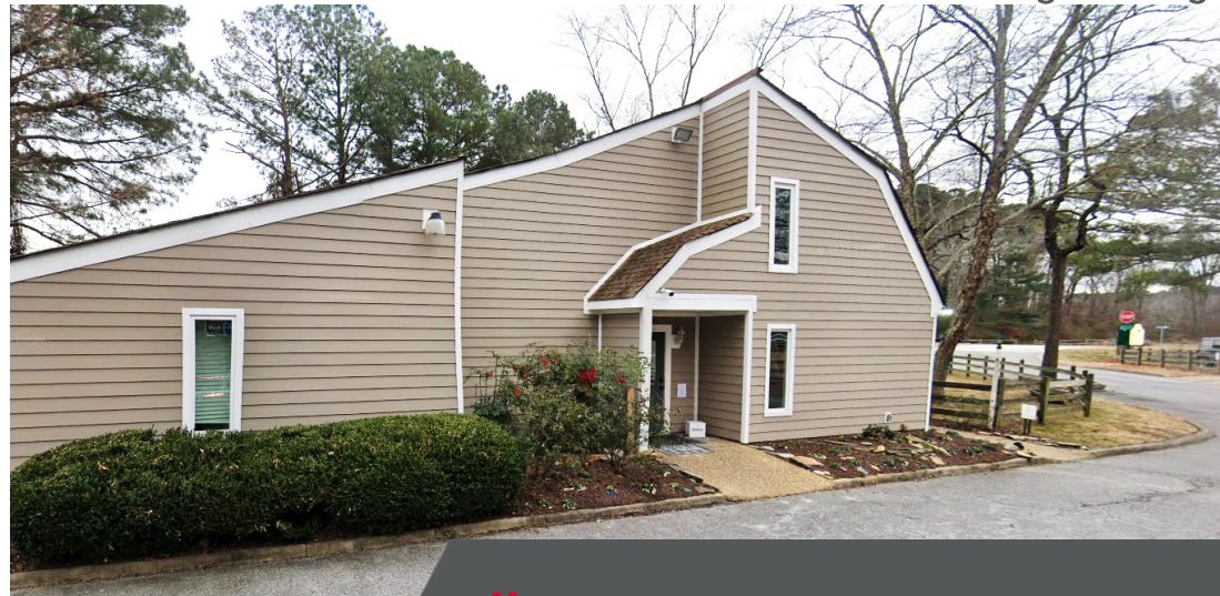
2492 Holland Road – Existing Building

// 2942 – 2500 HOLLAND ROAD Virginia Beach, Virginia 23453