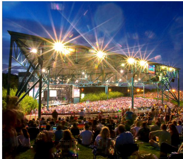
Veterans United Home Loans Amphitheater