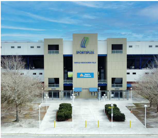
Virginia Beach Sportsplex