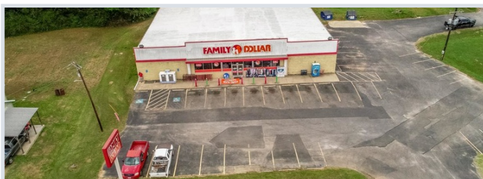
Exterior / Highway Frontage