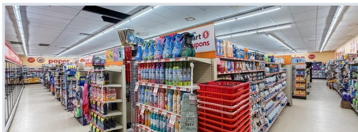
Open Retail Sales Floor