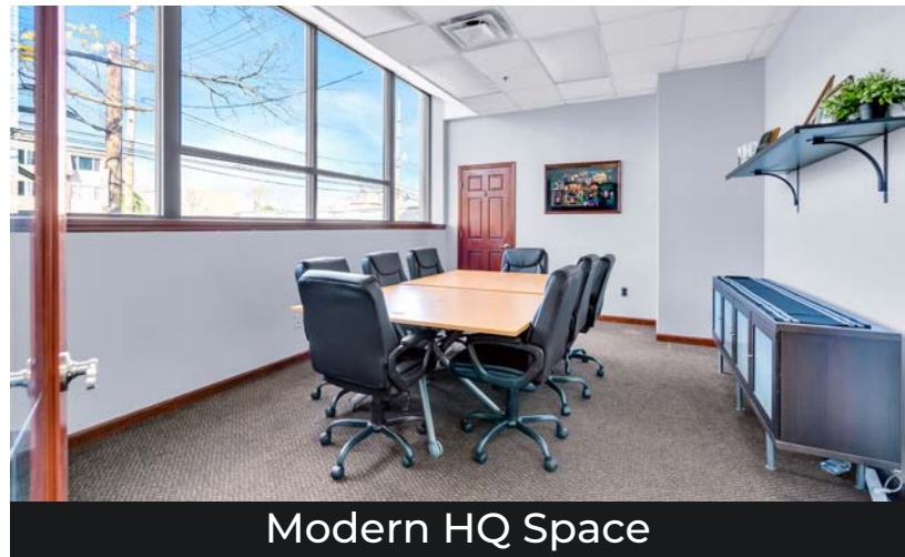
Modern HQ Space