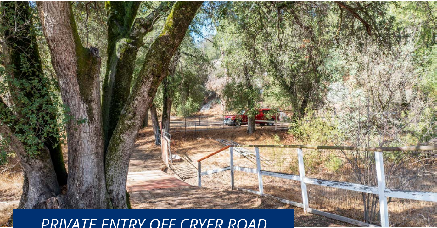
PRIVATE ENTRY OFF CRYER ROAD