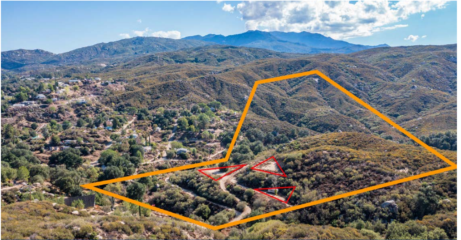
Approximation Of The Property's Perimeter Boundary Lines