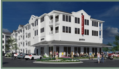
Building 3 Restaurant