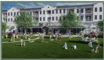
Building 1 Retail/Restaurant