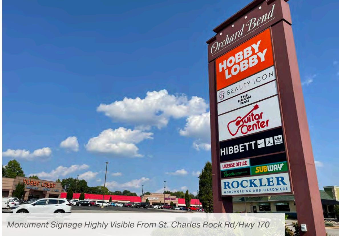
Monument Signage Highly Visible From St. Charles Rock Rd/Hwy 170