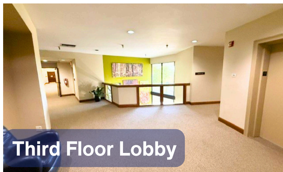
Third Floor Lobby