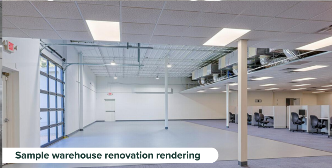
Sample warehouse renovation rendering