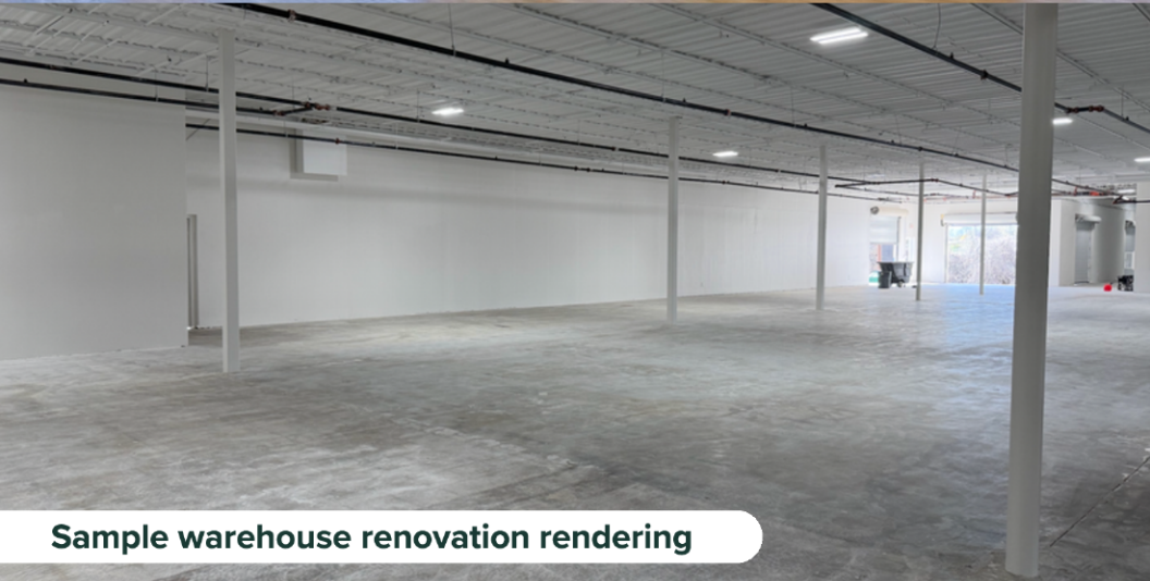
Sample warehouse renovation rendering