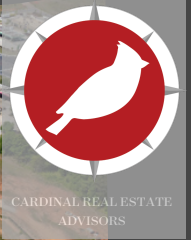
1140 HIDDEN HILL CT.