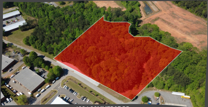
1091 COMMERCE DR.