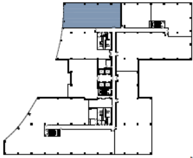
FLOOR LOCATION PLAN