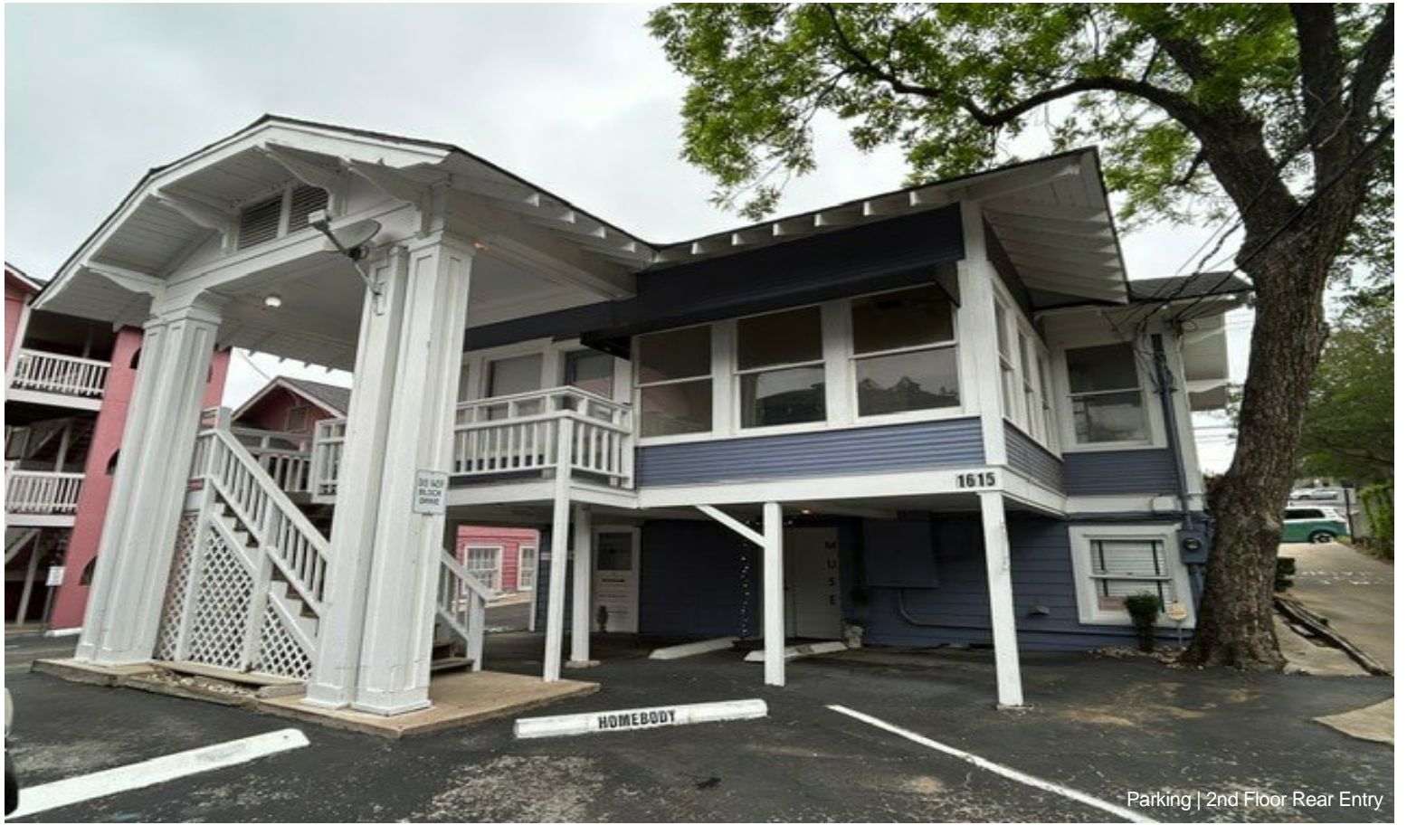
Parking | 2nd Floor Rear Entry