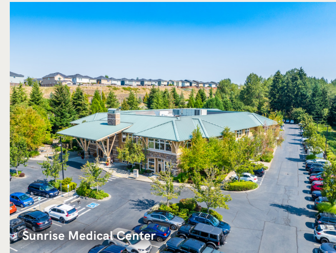
Sunrise Medical Center