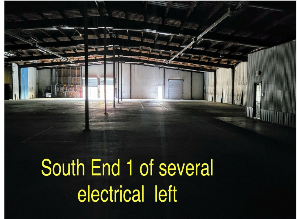
Office from w/h 2