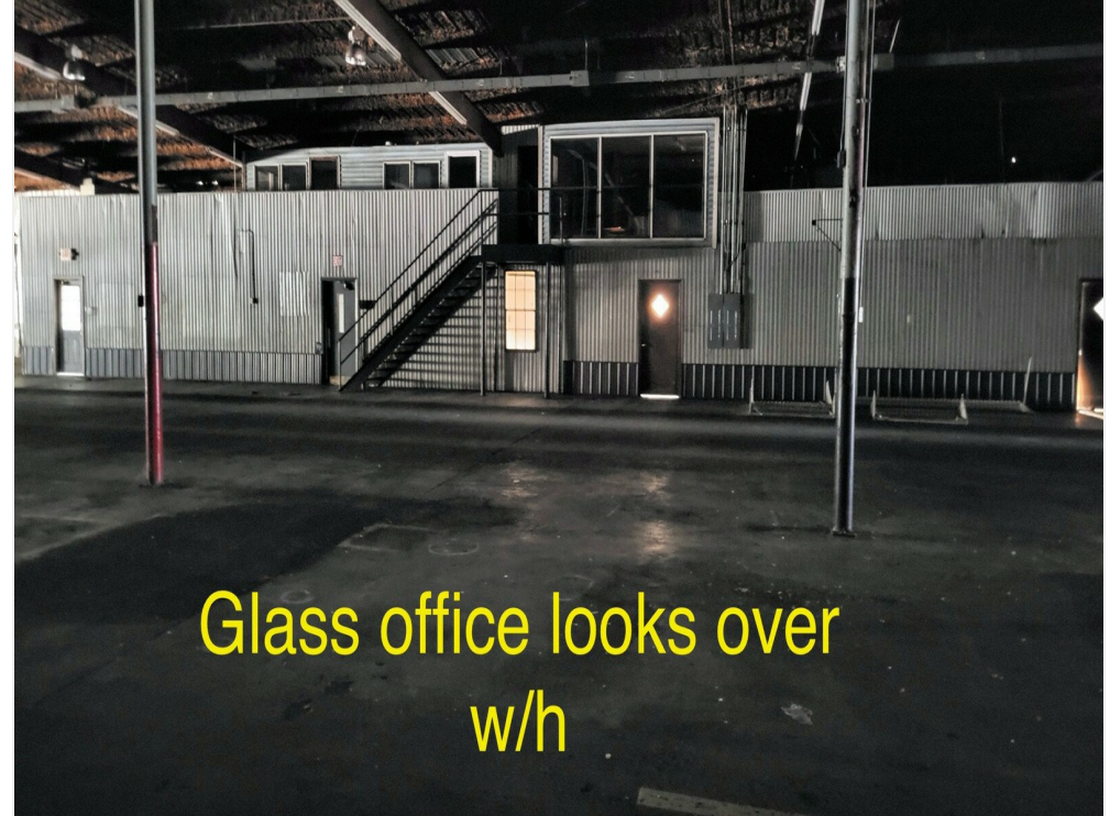
N. End w/h 2