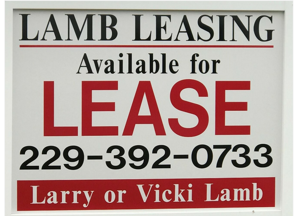
Lamb Leasing, LLC