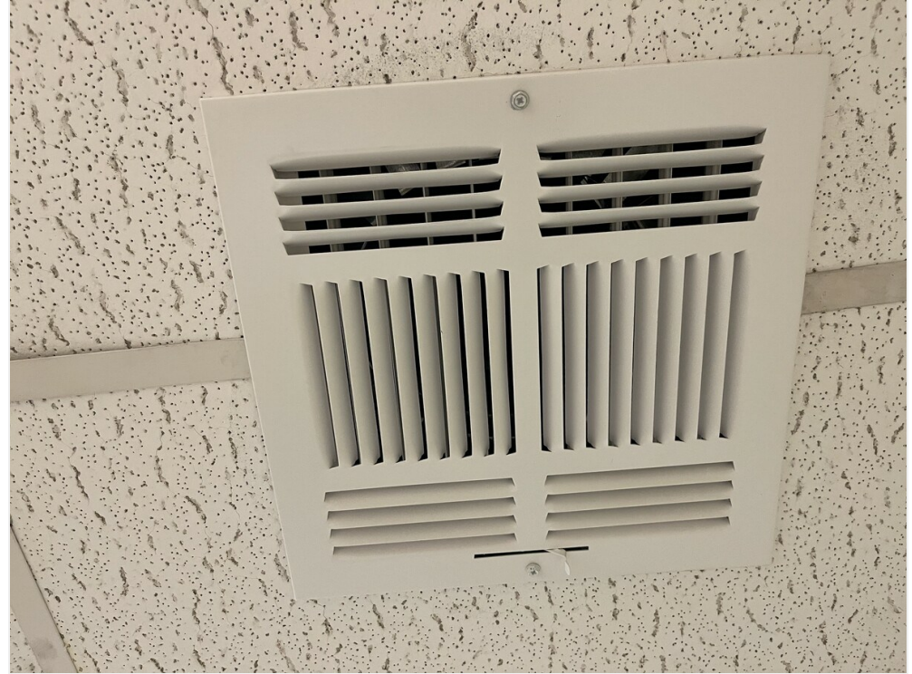
New vents & ductwork