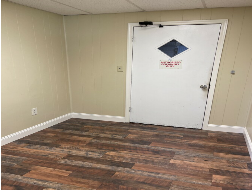
2nd w/h entrance from main office