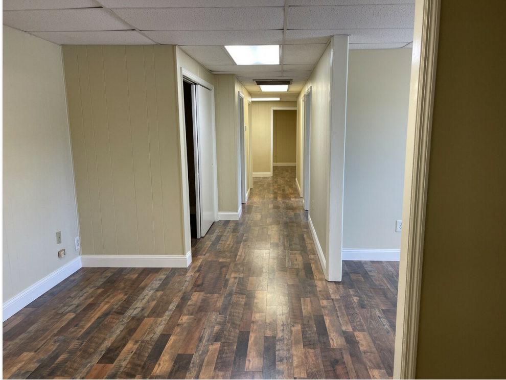
Hall North to South