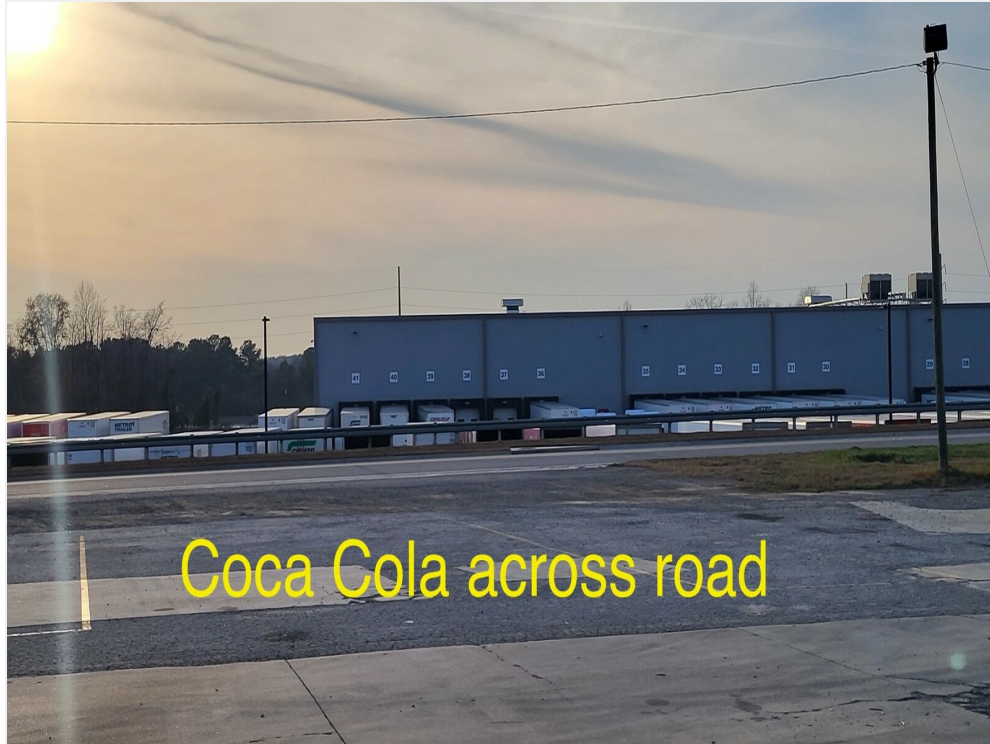
Coca Cola across Road