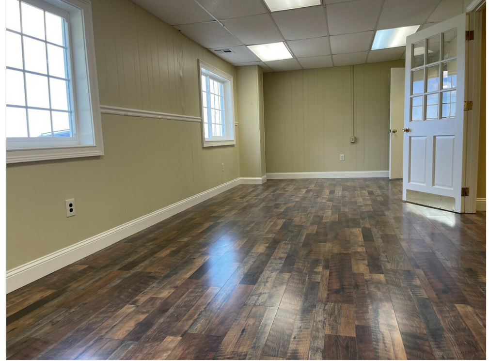
Office for 2 or 3 3rd view