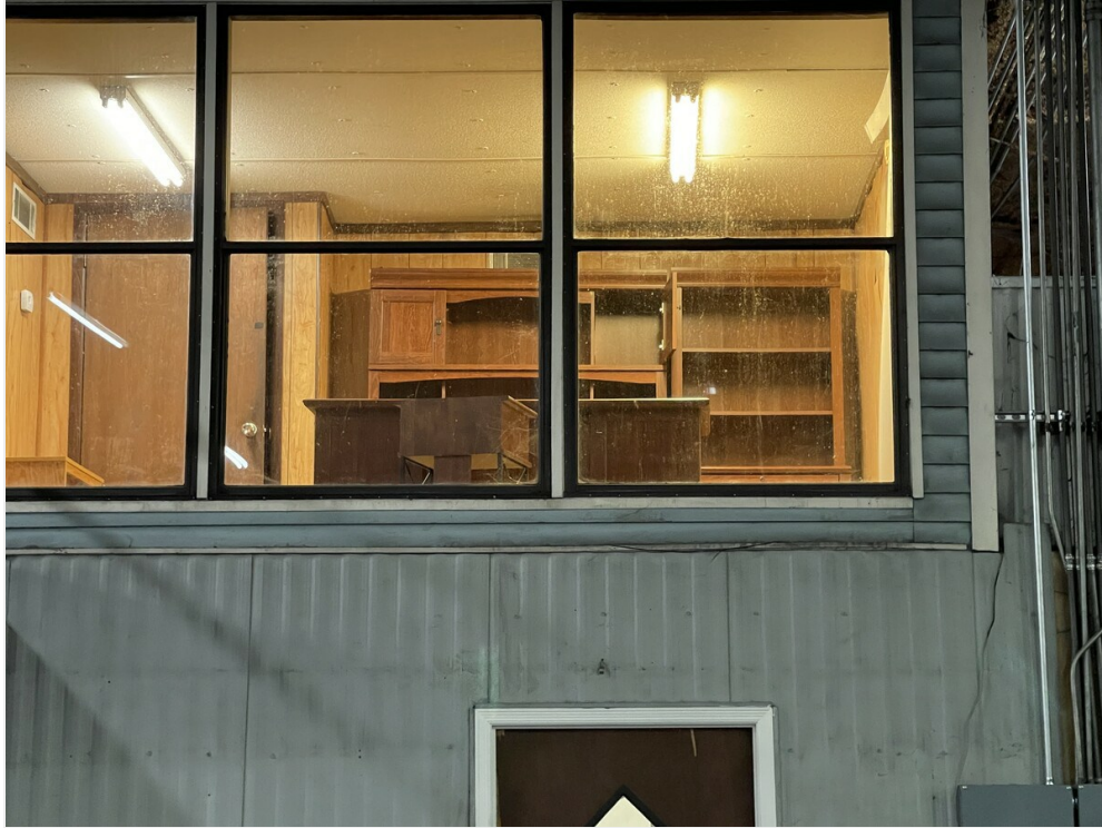
Upstairs office looks down on warehouse