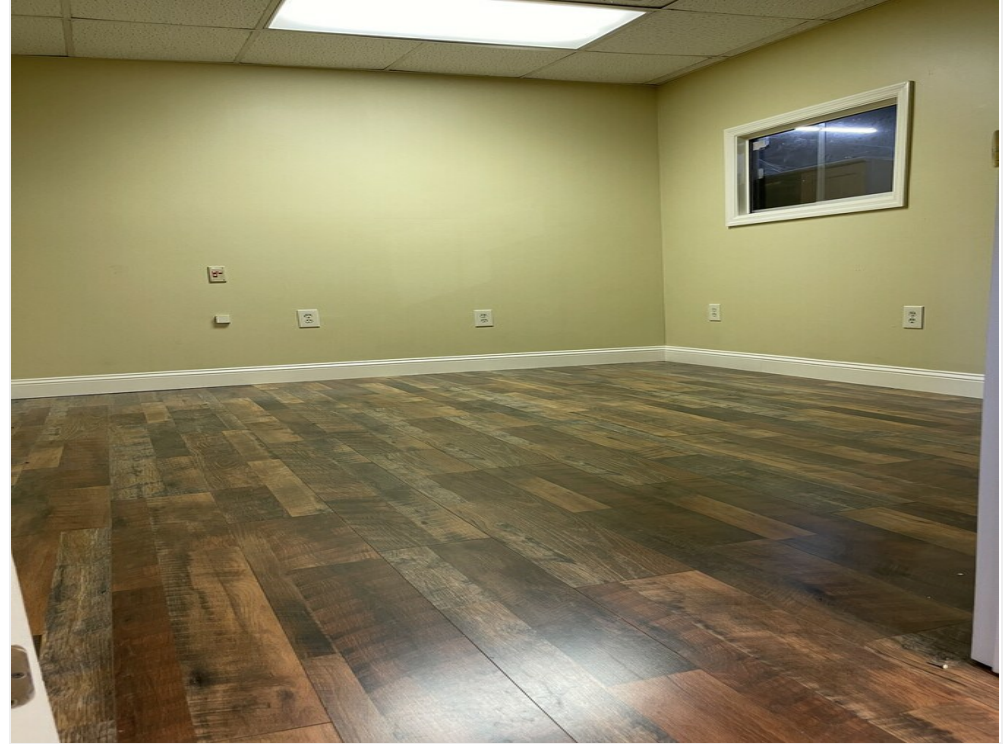
1st office East Side/window to warehouse