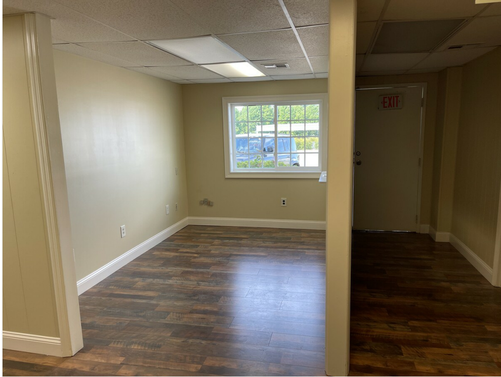
2 person office/pass thru opening to front entrance hall