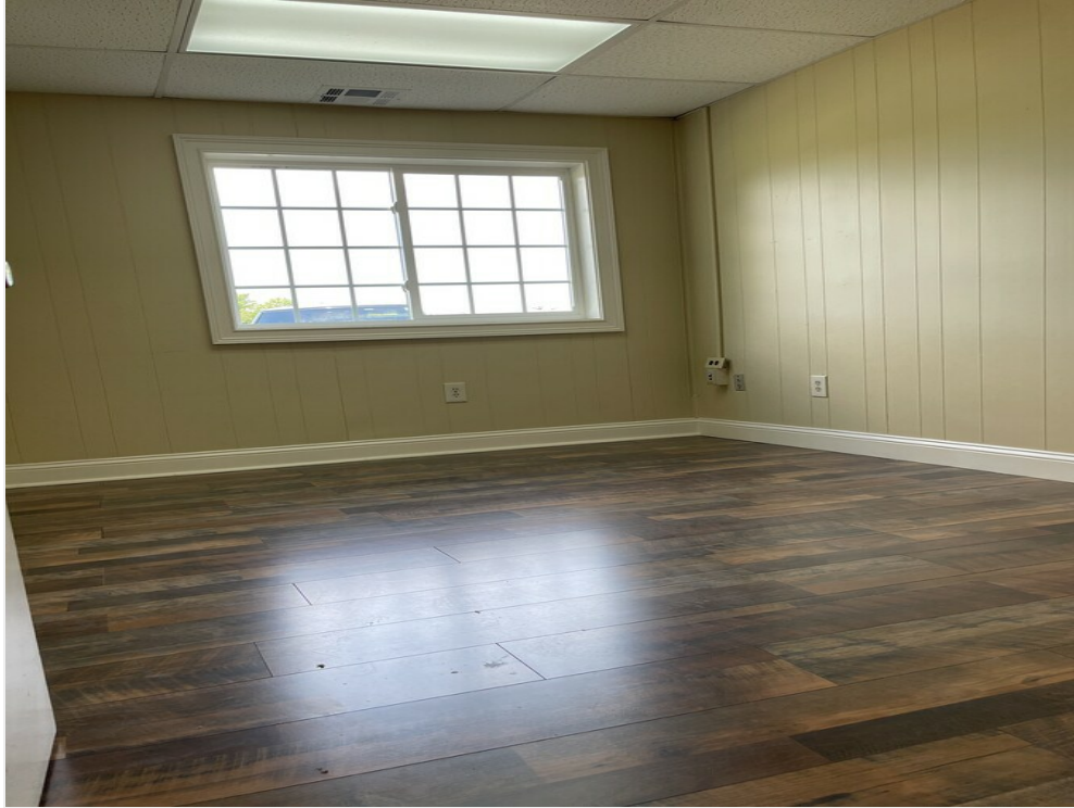
3rd office West side