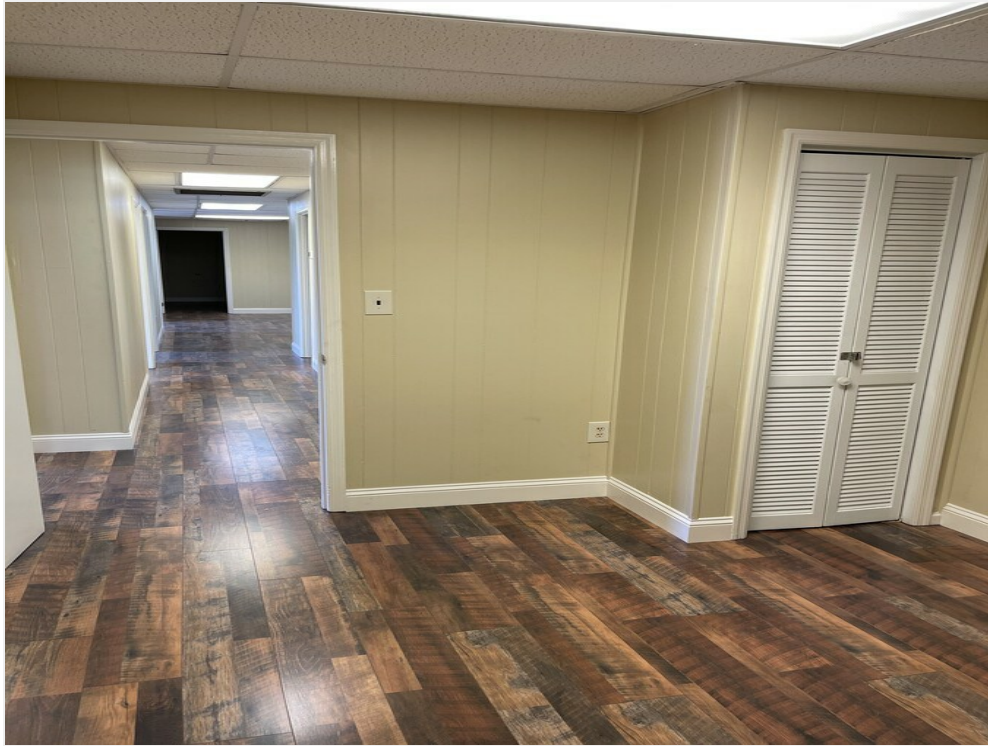
Storage & hall South to North