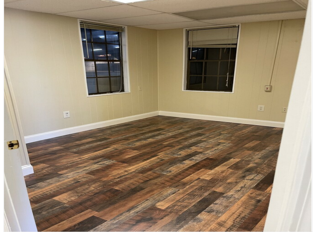
South end office