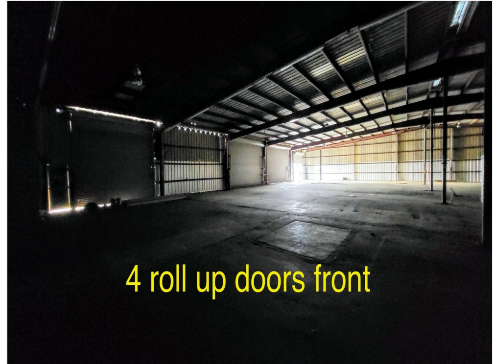
4 roll up doors front