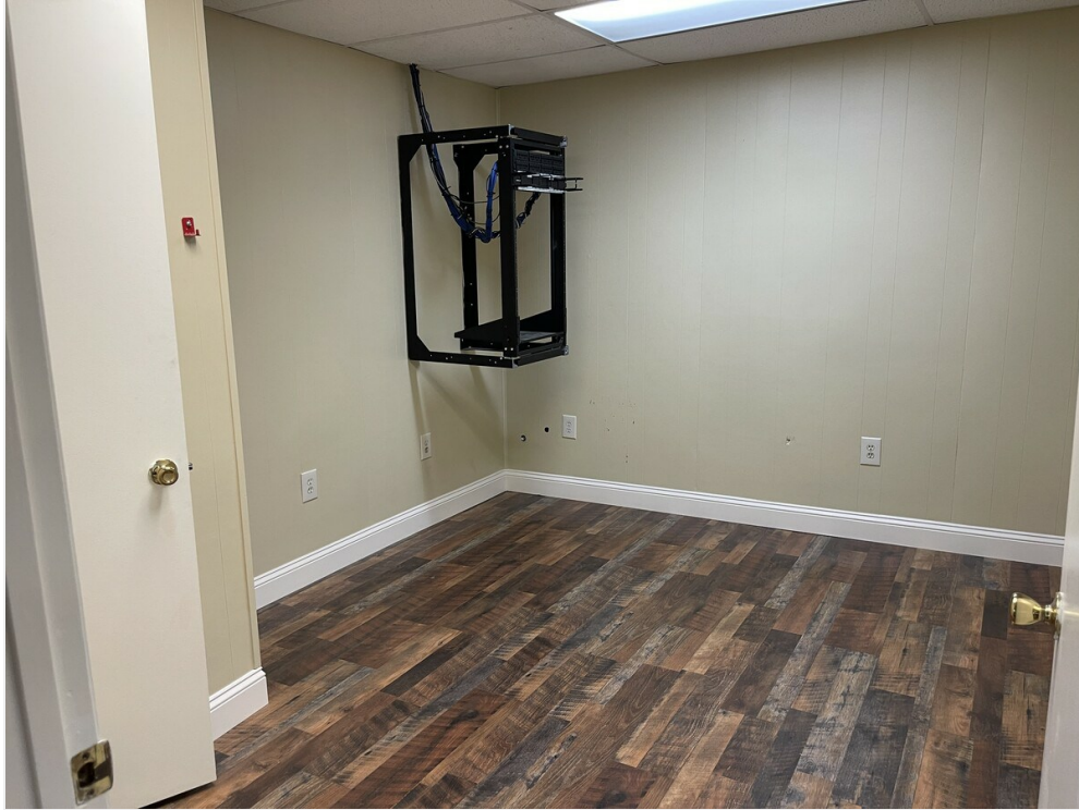
Data Center rack N/W office