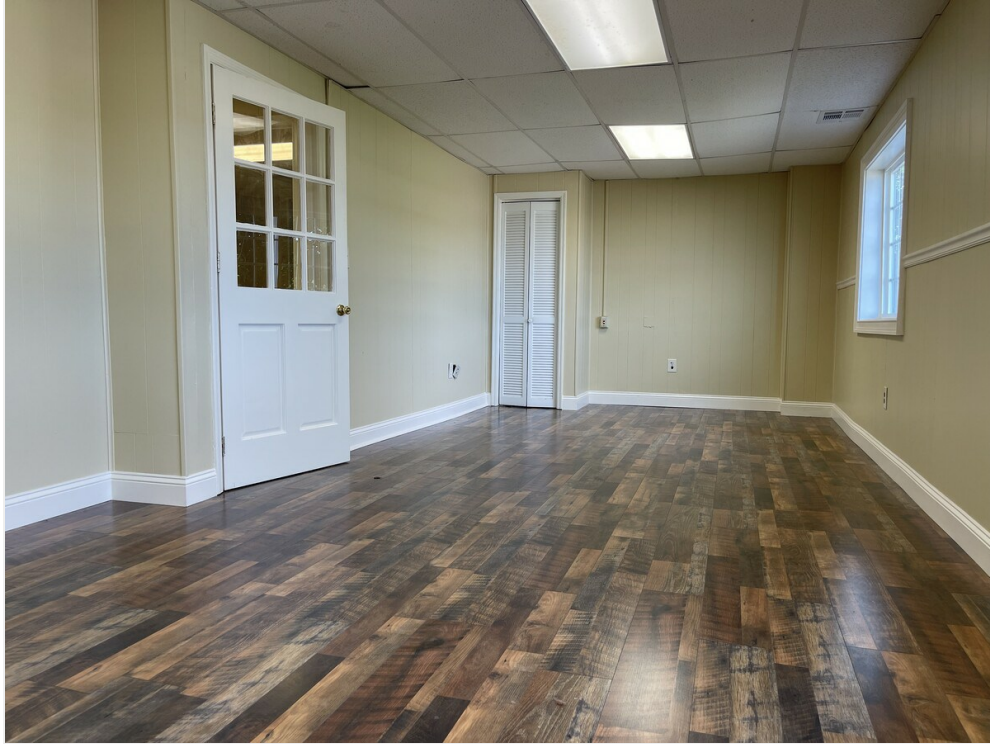
Office for 2 or 3 2nd view