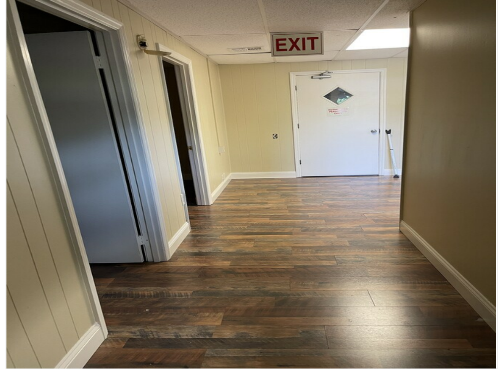
1st W/H entrance from office