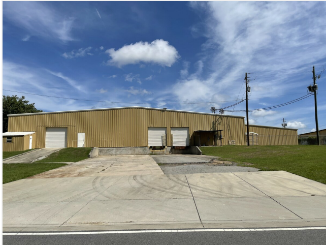
Dock Well End