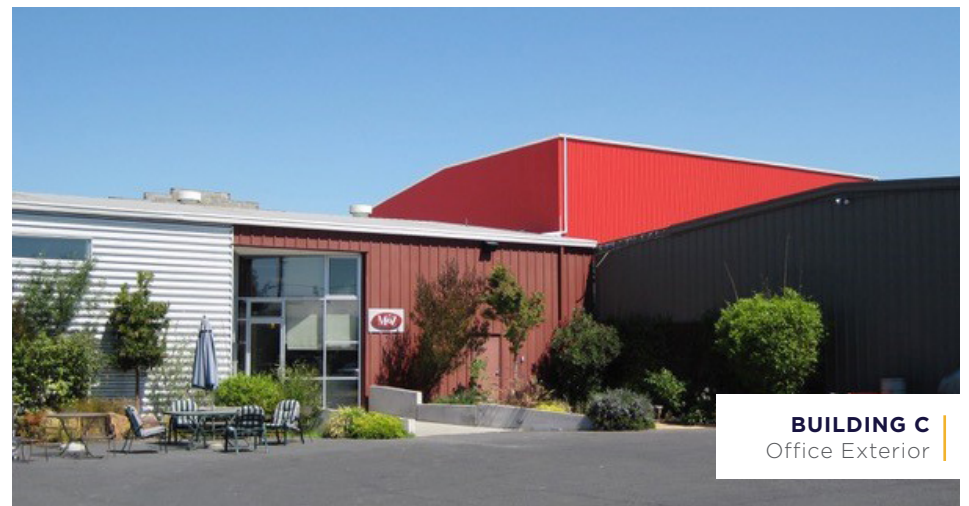
BUILDING C Office Exterior