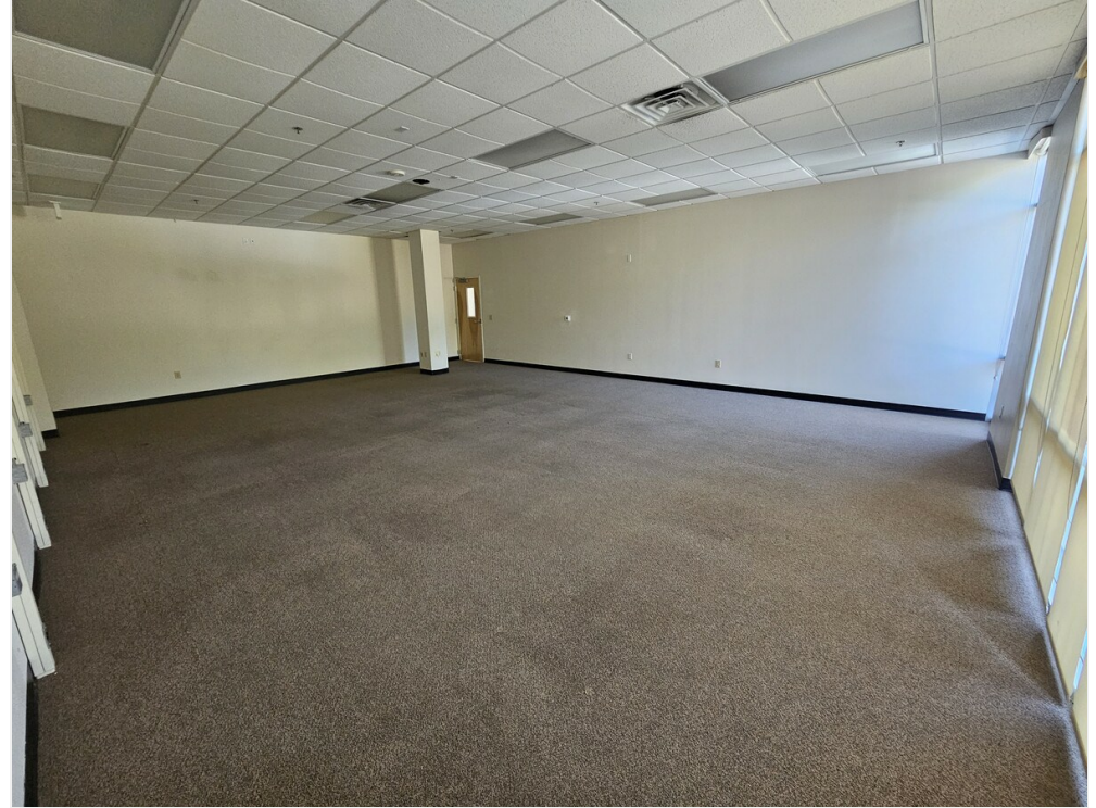
Classroom 102 (Unit 145B)