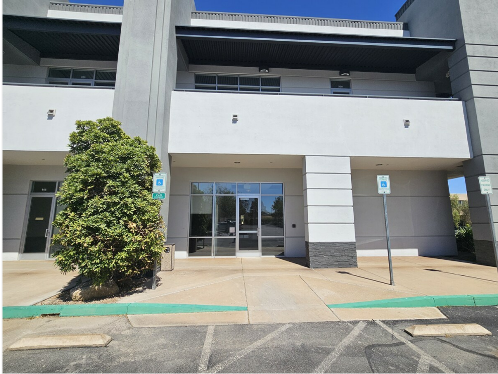
Unit 145B front