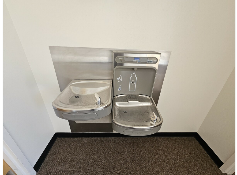
Water fountain (Unit 145B)