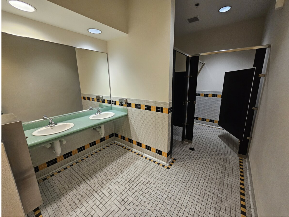
Women's Bathroom (Unit 145B)