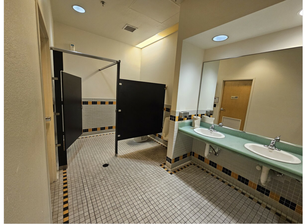
Men's Bathroom (Unit 145B)