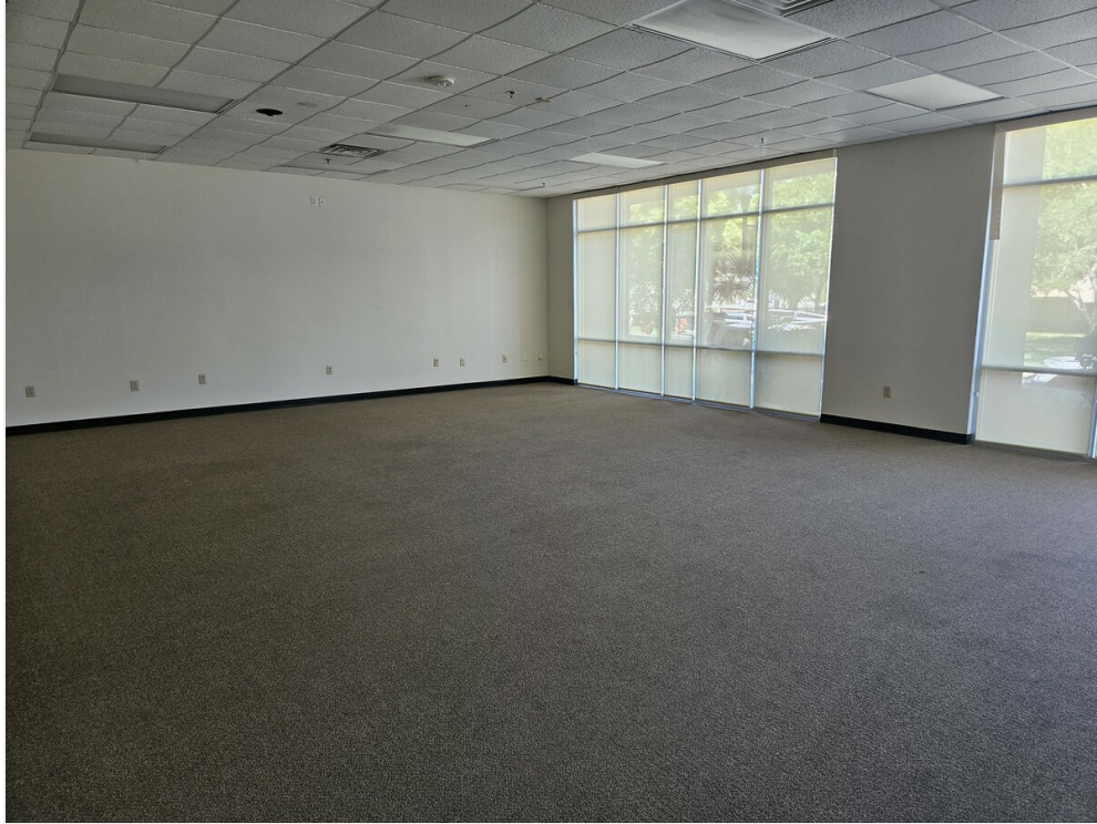
Classroom 101 (Unit 145B)