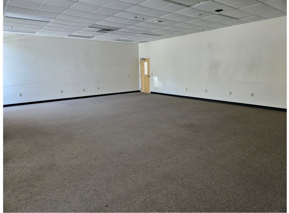
Classroom 101 (Unit 145B)