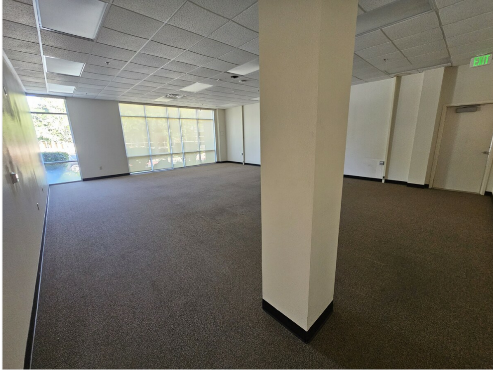
Classroom 102 (Unit 145B)