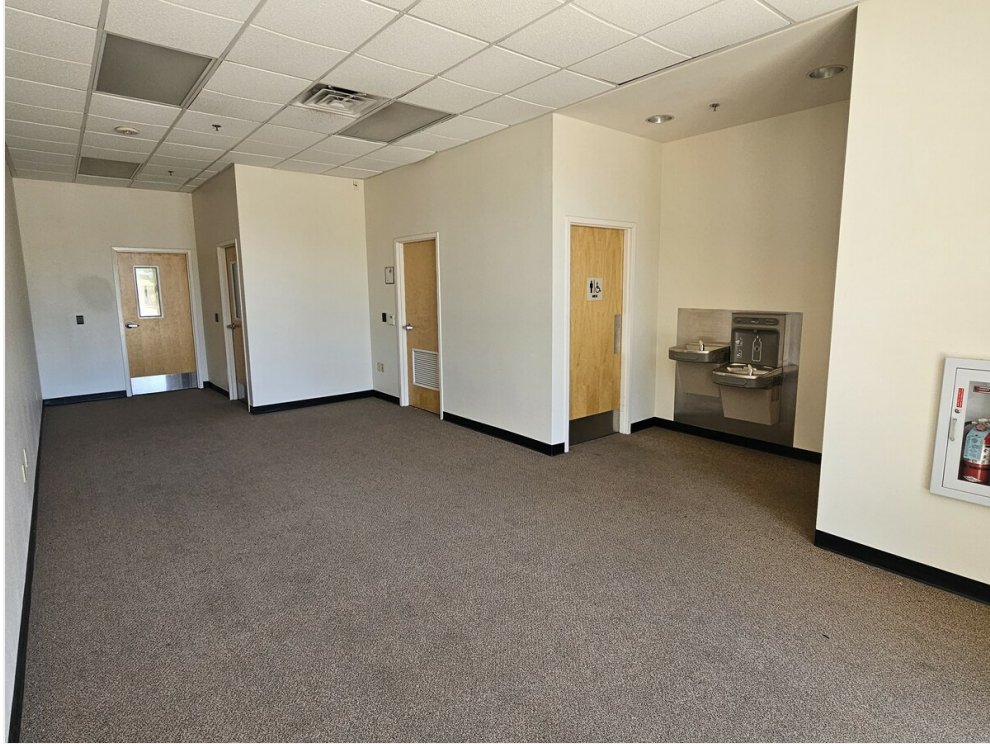
Lobby (Unit 145B)