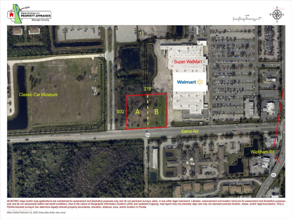
Aerial Sarno Lots West of SuperWalmart