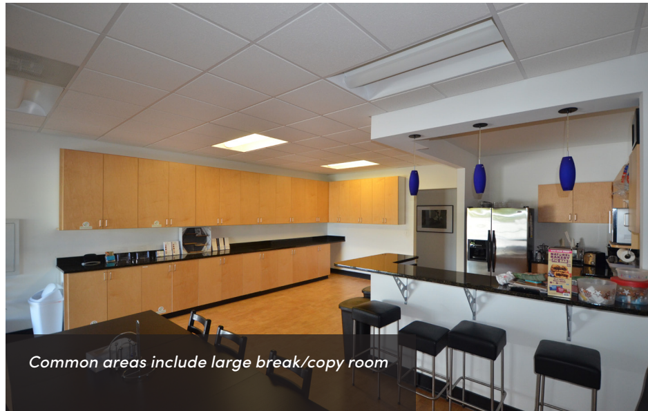
Common areas include large break/copy room