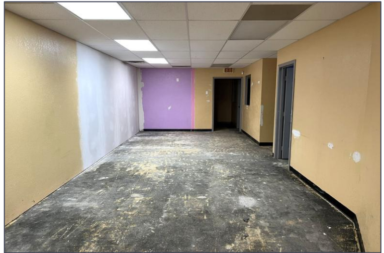
Unit 2 - 980 Sq. Ft.