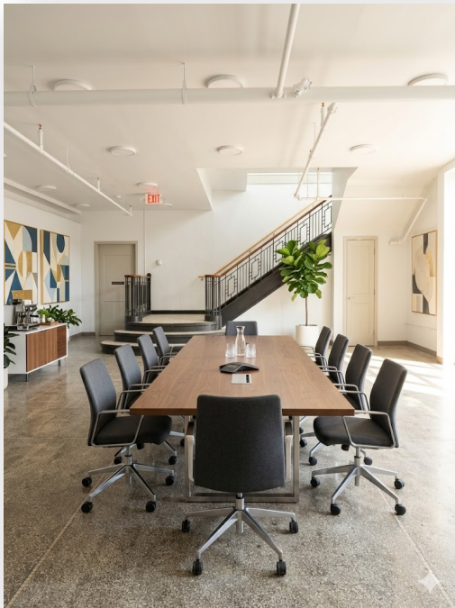
Furniture for display only