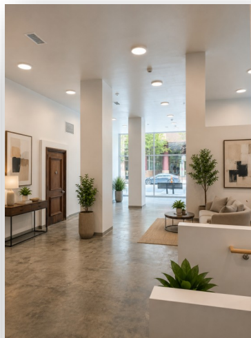
Furniture for display only