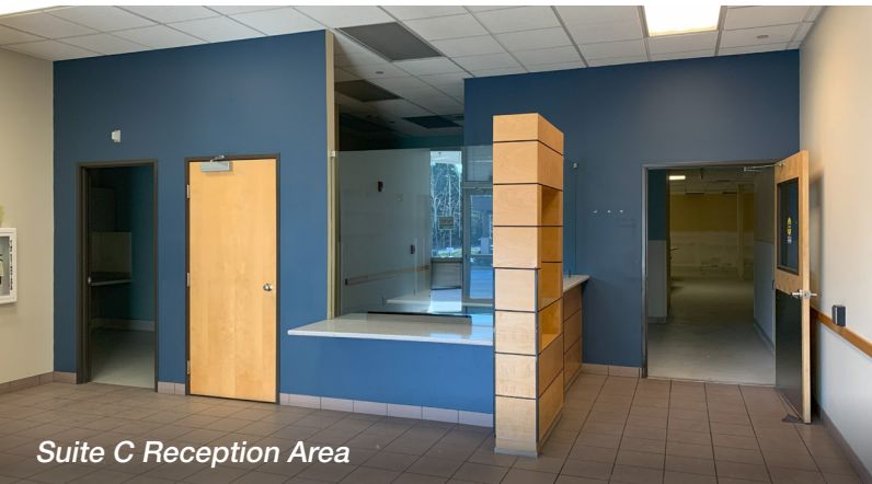
Suite C Reception Area