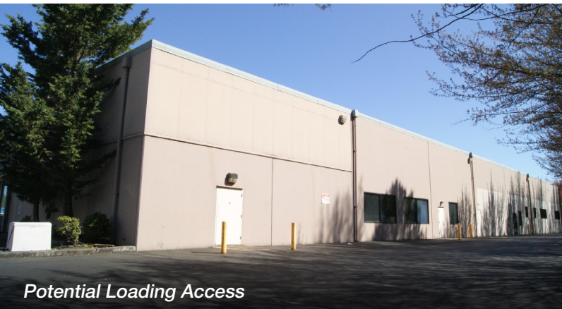
Potential Loading Access