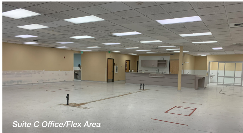
Suite C Office/Flex Area