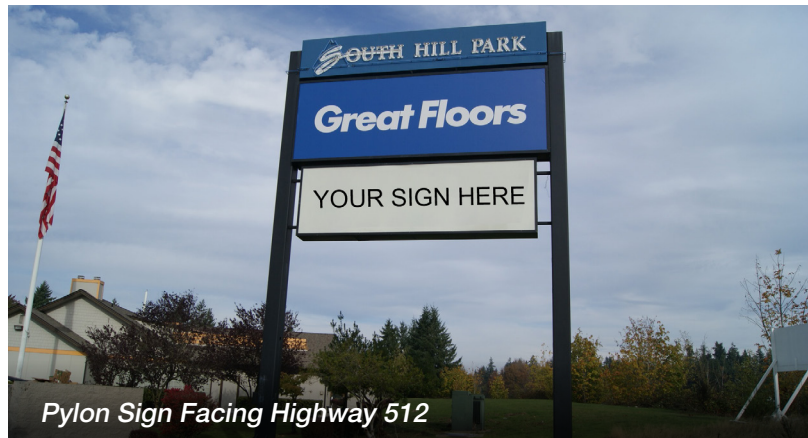
Pylon Sign Facing Highway 512

KIM MARVIK Partner +1 253 203 1325 kmarvik@nai-ppsp.com