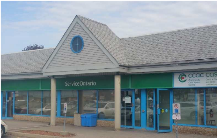
Unit B2-4 – 3,672 Sq. Ft.