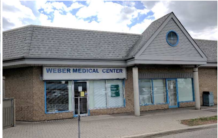
Unit A5 – 2,435 Sq. Ft.