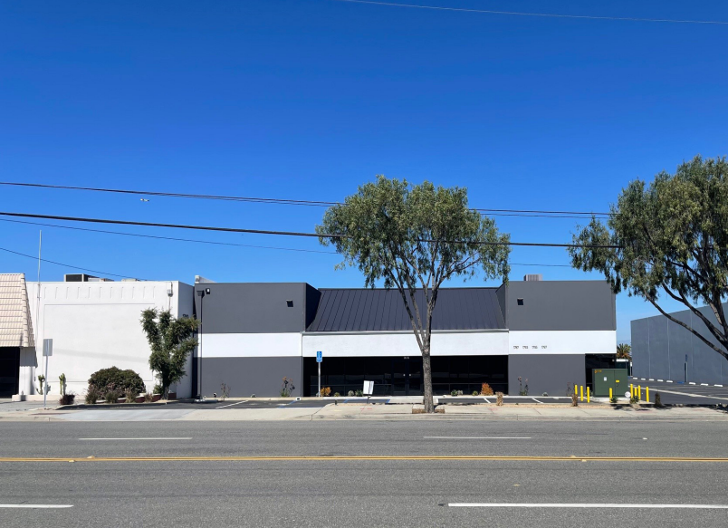
Under Construction - Almost Complete