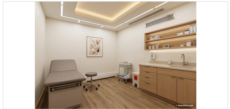
Exam Room — AI Rendering