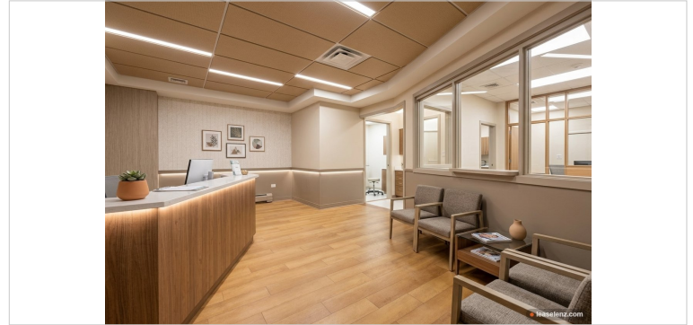
Reception / Waiting Area — AI Rendering