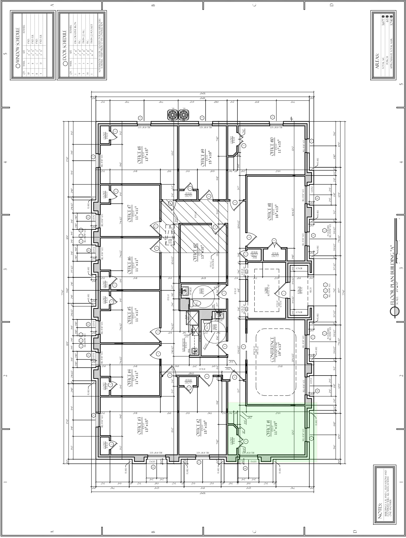
FLOOR PLAN BUILDING "A" SCALE: 1/4" = 1'-0"

PROVIDENTIAL CUSTOM HOMES STONEGLEN DRIVE STONEGLEN OFFICE PARK KELLER, TEXAS BUILDING 'A'