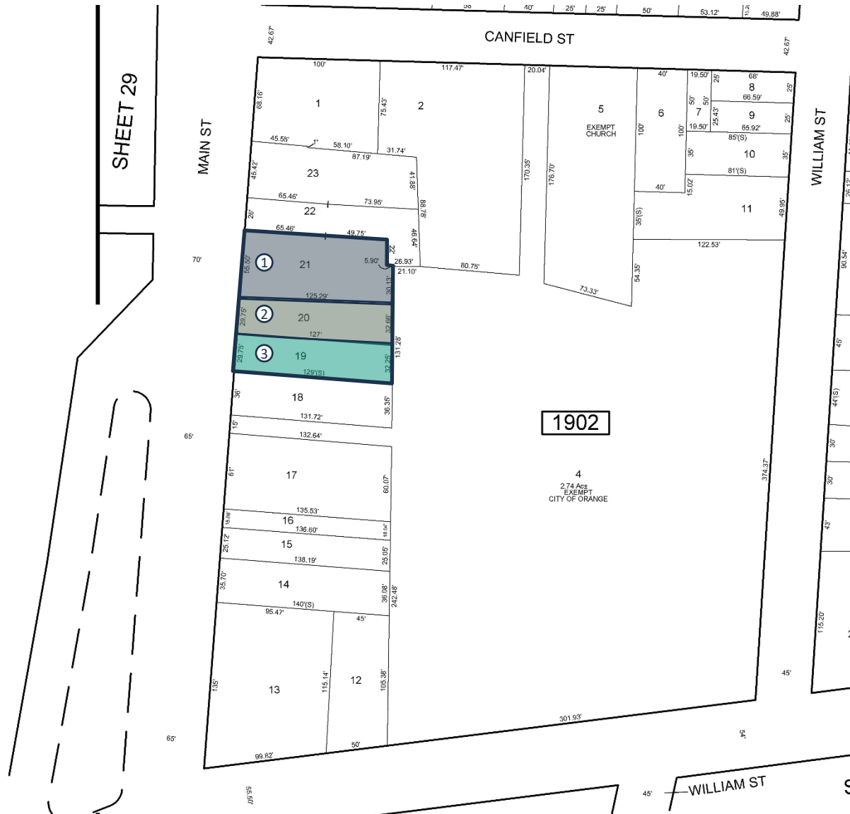
Retail Space Key